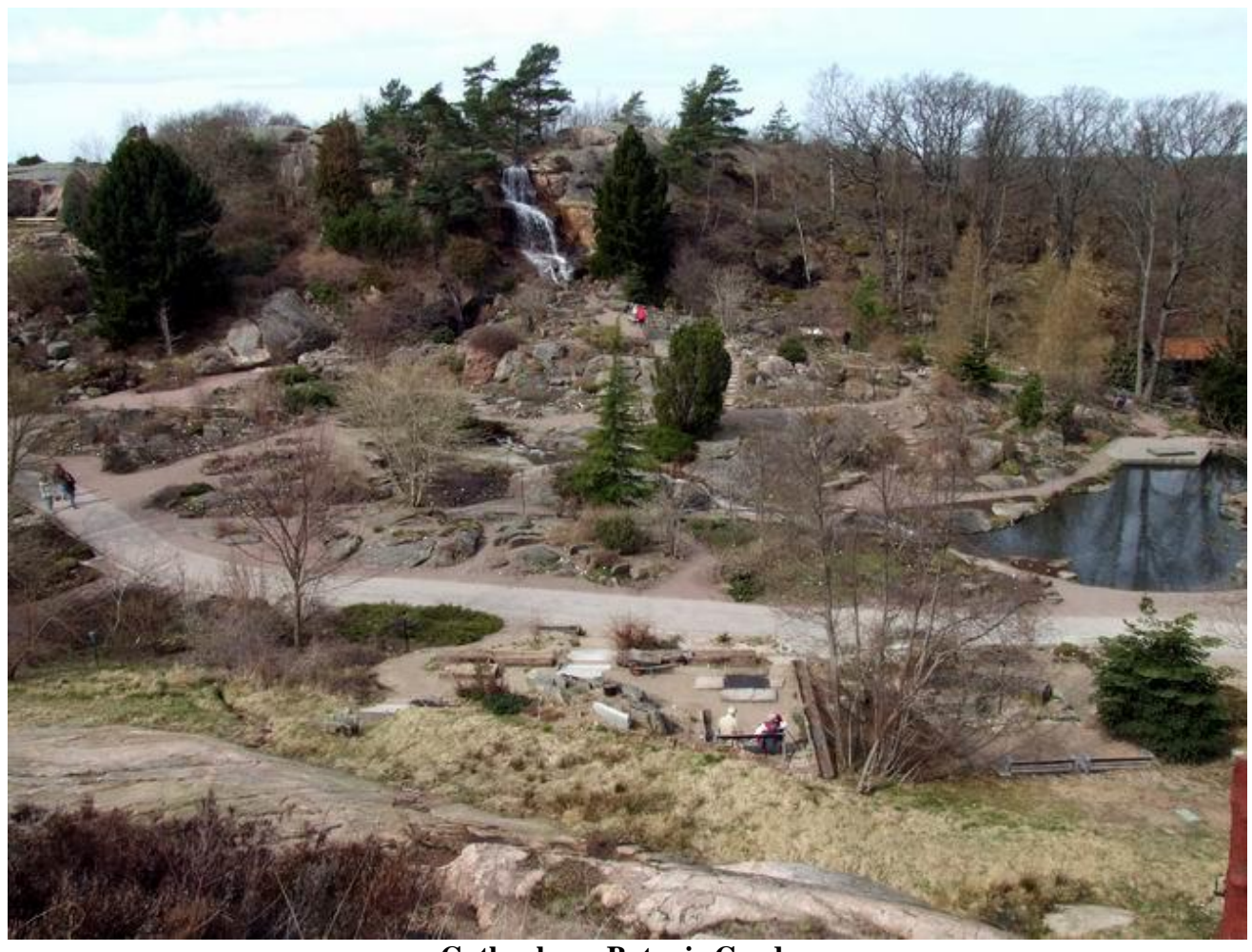
Gothenburg Botanic Garden

Then again in the autumn with the early snows painting a very different mountain scene.