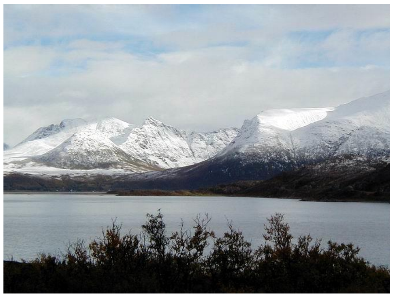
Arctic mountains autumn

Then again in the autumn with the early snows painting a very different mountain scene.