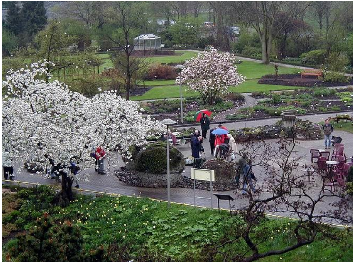
Utrecht Botanic Garden

Back over to Europe where I was so inspired by the layout and imaginative use of materials at the Utrecht Botanic Garden even though it never stopped raining while I was there.