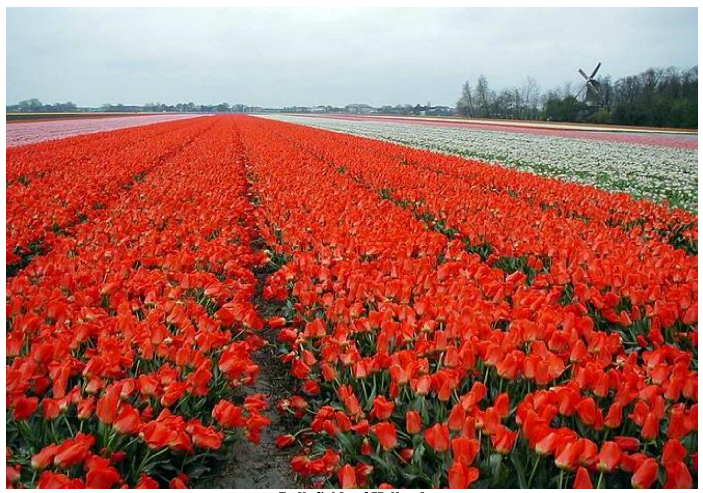
Bulb fields of Holland

Back over to Europe where I was so inspired by the layout and imaginative use of materials at the Utrecht Botanic Garden even though it never stopped raining while I was there.