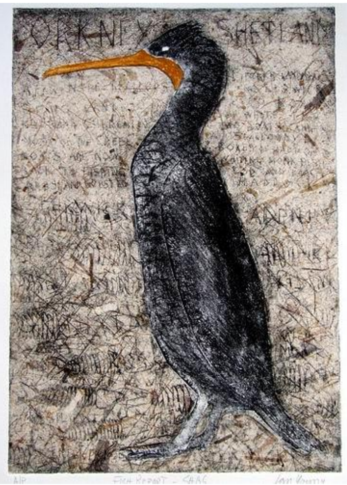
Fish report prints 2