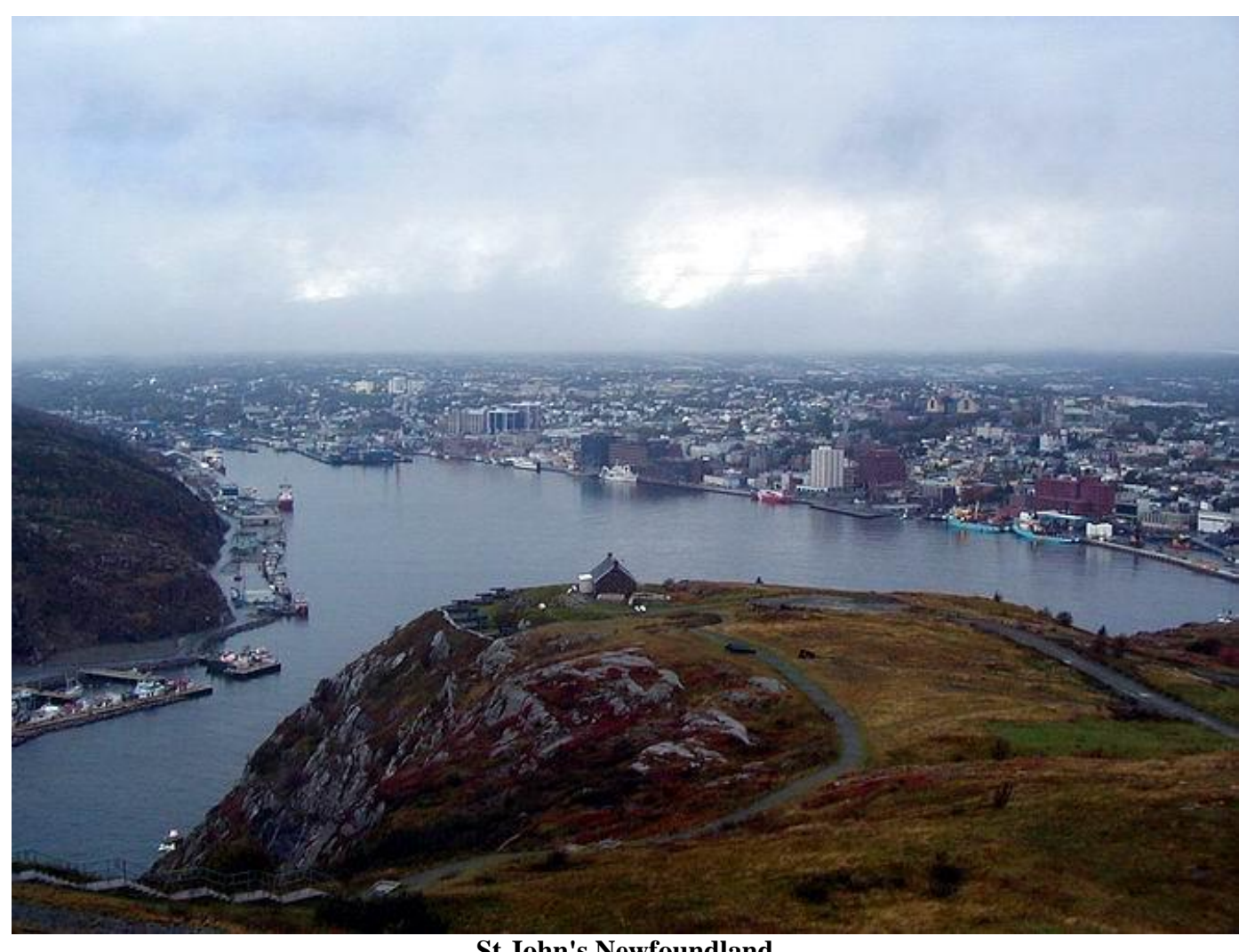
St John's Newfoundland

Jumping across the 'pond' the furthest north I have been there is St John's Newfoundland, in Canada, where I felt very much at home. Again it was an autumn visit and the colours of the heath land flora were stunning.