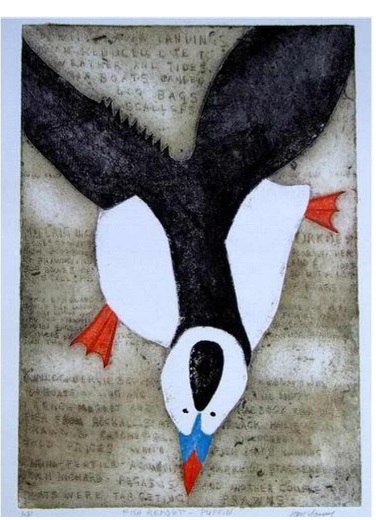
Fish report prints 1